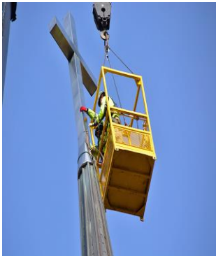
The Lord be with you!

I received another note addressed to Jesus from one of our little ones. "And a little child shall lead them"